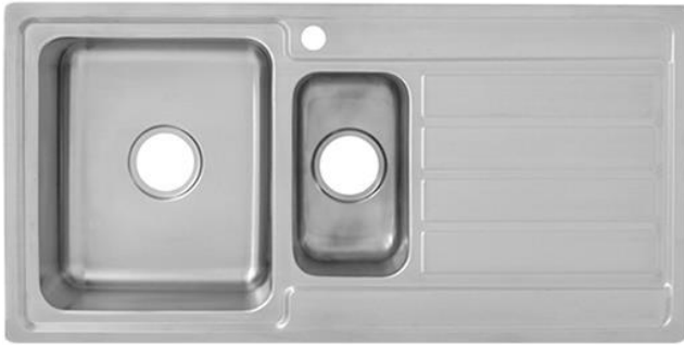
P5360L Left Hand Bowl